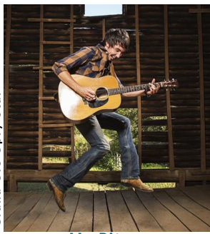
Grand Ole Opry Star Mo Pitney