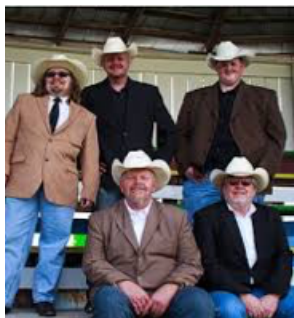
Hard-Driving Traditional Bluegrass Bluegrass Brothers

Presented By: The Upperco Volunteer Fire Company