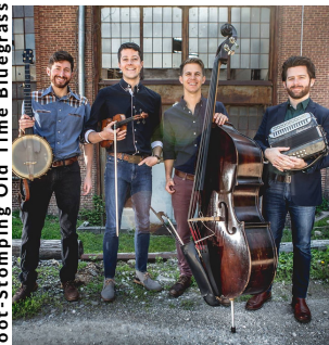
Foot-Stomping Old Time Bluegrass Charm City Junction